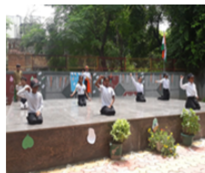
Song by Music Basti at the PTS Branch