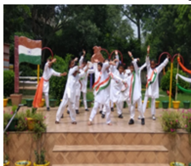
Dance by Grade 2 at VIDYA Sarvapriya Vihar