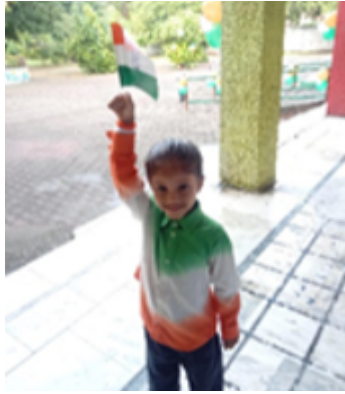
Hauz Khas Independence day Celebrations