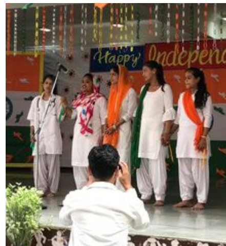
Patriotic Song sung by the students of VIDYA School Gurugram

After the flag hoisting, she stepped onto the stage and filled the atmosphere with her inspiring talk and joyous interaction, with the students, by relating her experiences of her extraordinary journey, of climbing the Everest and other peaks, in an excited manner.